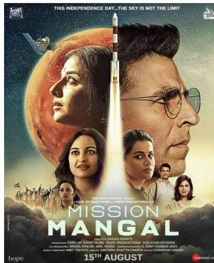
Fig.3 Mission Mangal Poster

In the 21st century, Indian cinema has witnessed a significant transformation in how women are portrayed on screen. The roles have become more diverse, and filmmakers are beginning to break free from the traditional mold of female characters. Movies like Queen (2013) , Piku (2015) , Tumhari Sulu (2017) , and Mission Mangal (2019) reflect the growing trend of strong, independent women who navigate life on their terms. These films emphasize women's independence, career aspirations, and emotional resilience, catering to an audience that seeks more realistic and empowered portrayals.